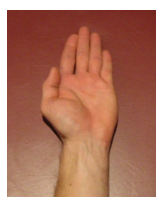
Figure 3 – Finger Adduction (left hand)

Begin this exercise with your fingers and thumb in the position shown (figure 3). Keeping your fingers straight, squeeze your fingers and thumb together in this position as hard as possible and comfortable without pain. Hold for 5 seconds and repeat 10 times.