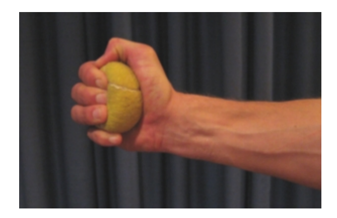
Figure 1 – Tennis Ball Squeeze (right hand)

Begin this exercise holding a tennis ball (figure 1). Squeeze the tennis ball as hard as possible and comfortable without pain. Hold for 5 seconds and repeat 10 times.