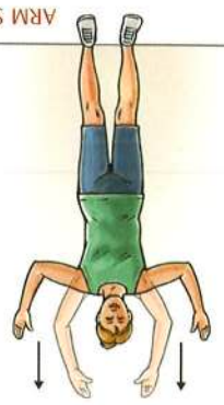
ARM SLIDE ON WALL

3. ARM SLIDE ON WALL: Sit or stand with your back against a wall and your elbows and wrists against the wall. Slowly slide your arms upward as high as you can while keeping your elbows and wrists against the wall. Do 3 sets of 10.