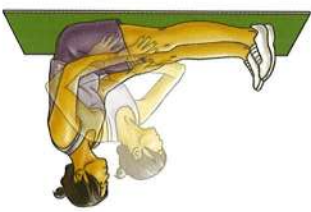
THORACIC SIDE STRETCH

7. THORACIC SIDE STRETCH: To stretch your right upper back, point your right elbow and shoulders forward while twisting your trunk to the left. Hold for a count of 15. Repeat 3 times. To stretch your left upper back, point your left elbow and shoulder forward while twisting your trunk to the right. Hold for a count of 10. Repeat 3 times.