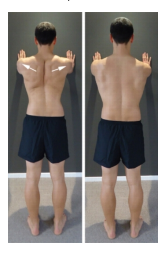
Figure 3 – Shoulder Blades Forwards Against Wall

Begin this exercise standing with your back and neck straight and your hands against the wall as shown (figure 3). Your shoulder blades should be squeezed together fully in this position, your elbows straight and you should be leaning into the wall slightly. Keeping your back and neck straight, slowly bring your shoulder blades forward allowing your arms to lengthen. Hold for 2 seconds and then slowly return to the starting position. Repeat 10 times provided the exercise is pain free.