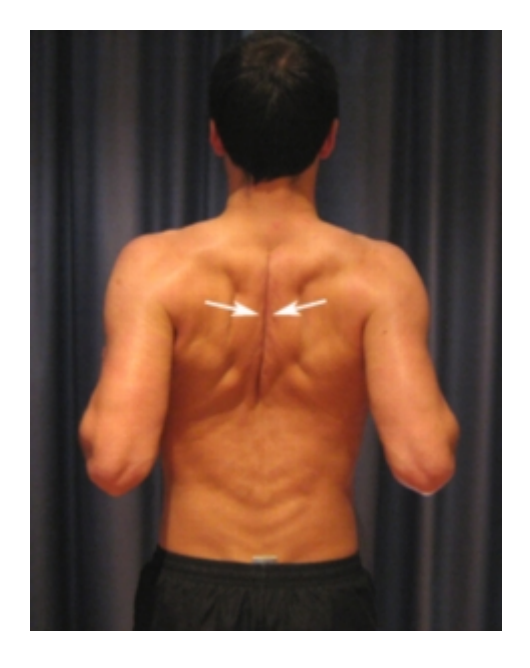
Figure 1 – Shoulder Blade Squeeze

Begin this exercise standing or sitting with your back and neck straight. Your chin should be tucked in slightly and your shoulders should be back slightly. Slowly squeeze your shoulder blades together as hard and far as you can go without pain and provided you feel no more than a moderate stretch (figure 1). Hold for 5 seconds and repeat 10 times provided the exercise is pain free.