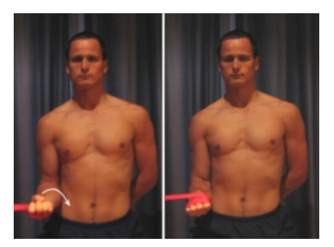
Figure 4 – Resistance Band Pronation (right arm)

Begin this exercise with a resistance band around your hand as demonstrated (figure 4). Your elbow should be at your side and bent to 90 degrees. Slowly rotate your forearm against the resistance band so your palm faces down. Perform 3 sets of 10 repetitions as far as possible and comfortable without pain.